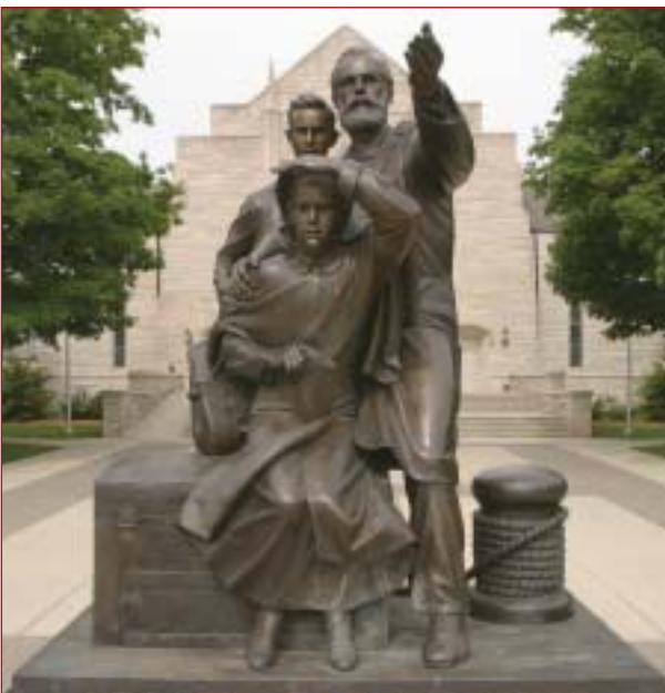
It is no accident that the Seventh-day Adventists sent their first overseas missionary (J.N. Andrews, depicted above with his children in a statue at Andrews University) and founded their first college the same year (1874).

Seventh-day Adventism has never seen itself as merely another denomination. Rather, from its very inception, it has viewed itself as a movement of prophecy with a mission to all the world.