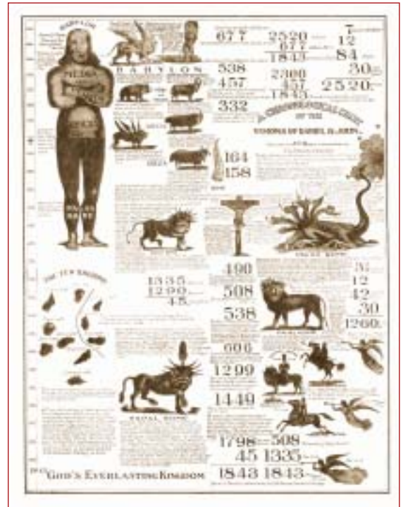
Early Millerite visual aid: "A Chronological Chart of the Visions of Daniel & John."

Both the birth and the development of Seventh-day Adventist education were stimulated by the explosive fuel of apocalyptic mission.