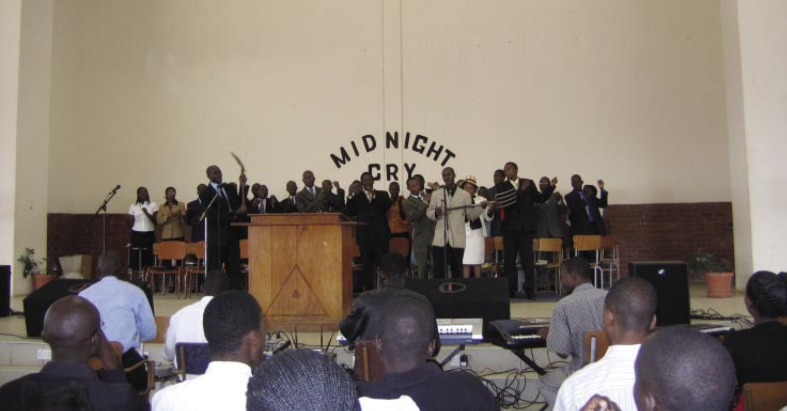
Students sing about working for the Lord at Solusi University (Bulawayo, Zimbabwe).

mense fluctuation and transition. This is when people make the commitments that guide them through life. And during this critical time, college professors play a very significant role. 4