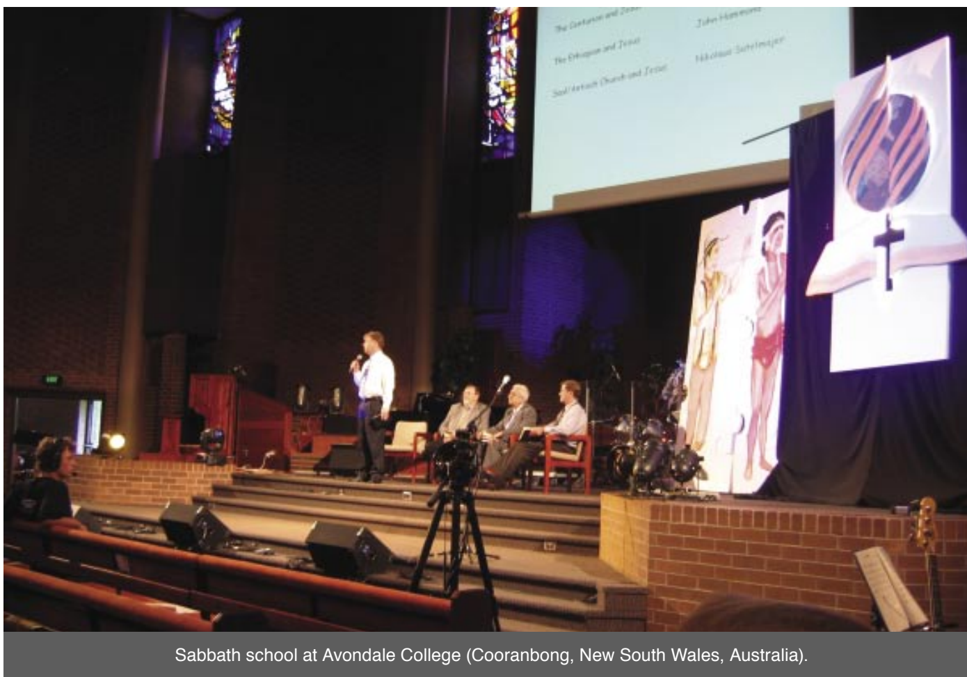
Sabbath school at Avondale College (Cooranbong, New South Wales, Australia).

A strong religious identity will . . . make our campuses attractive to college-age young people generally.