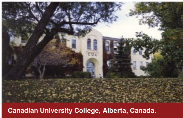
Canadian University College, Alberta, Canada.