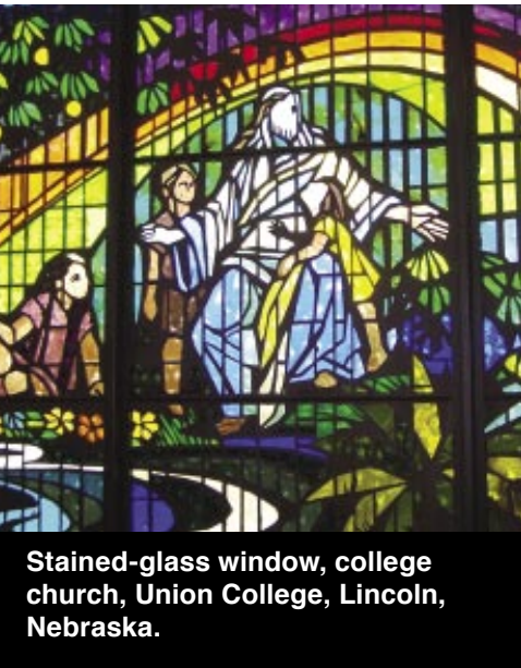
Stained-glass window, college church, Union College, Lincoln, Nebraska.