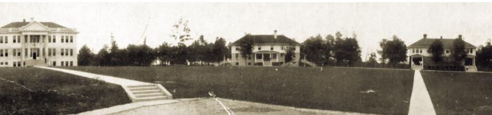
Washington Foreign Mission Seminary (now Columbia Union College), Takoma Park, Maryland, between 1905 and 1913.