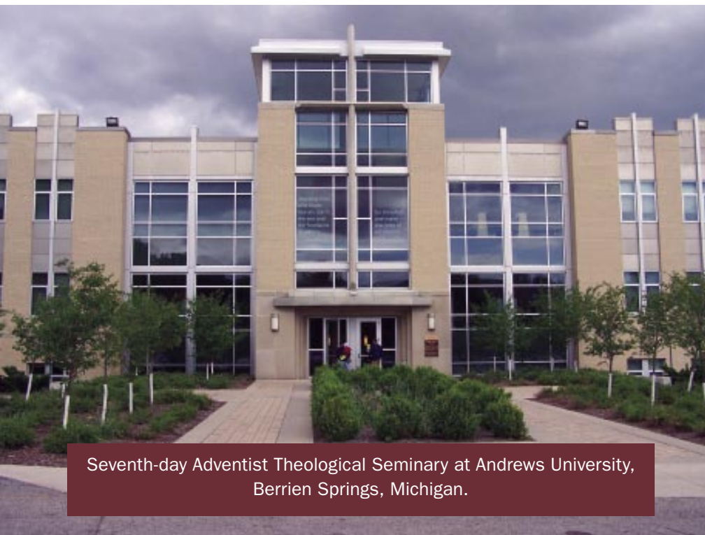
Seventh-day Adventist Theological Seminary at Andrews University, Berrien Springs, Michigan.