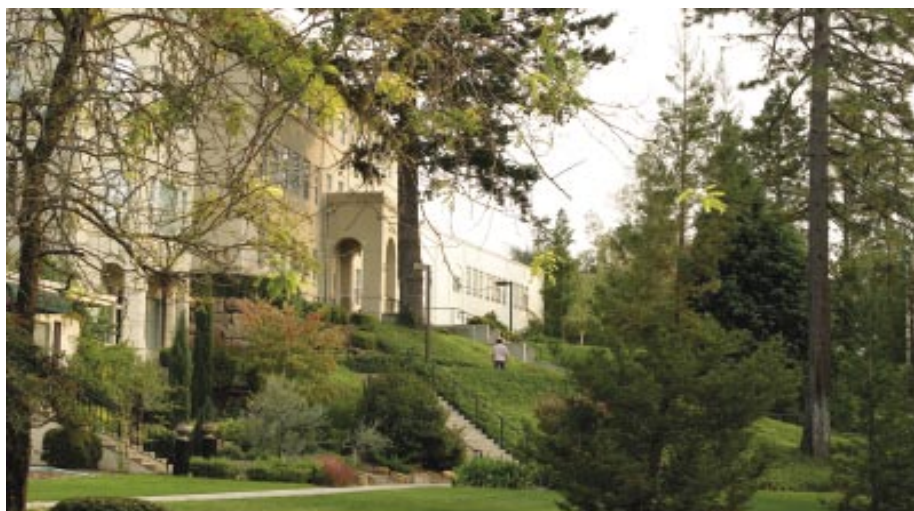
Pacific Union College, Angwin, California.

T he issue of ministerial education rested on the assumption that the denomination had an inherent right to shape and direct the education of its clergy. The model worker-training school envisioned by 19th-century church leaders eventually became a reality in the