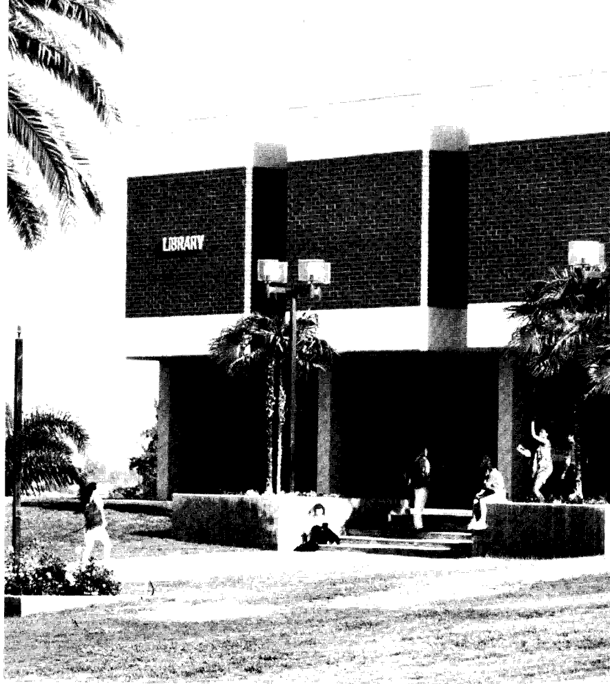
Library, La Sierra University.

This index provides a reference to doctoral dissertations submitted to the School of Education faculty during the 1991-1992 school year. The investigations were part of program requirements for graduate degrees including the M.A. and Ed.D. in administration and leadership and the Ed.D. in curriculum and instruction. M.A. theses are available for U.S. $.10 (10 cents) per page from the Dean's Office, School of Education, La Sierra University, Riverside, CA 92515. (Telephone: 714-785-2266). Copies of the doctoral dissertations may be obtained from Uni-