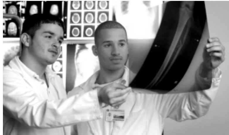
Florida Hospital College of Health Sciences, like its parent organization, Florida Hospital, was established to reach out to the community to practice the ministry of Jesus and to provide excellent training and health care.