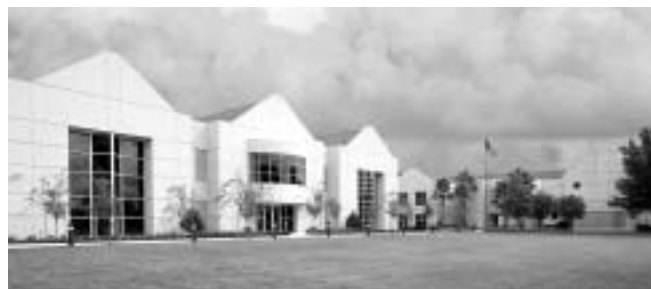
Florida Hospital College of Health Sciences (FHCHS), Orlando, Florida.

F lorida Hospital College of Health Sciences (FHCHS) is in its 10th year of operation. When it opened its doors in 1992 with 242 students, it was an infant institution without credentials. Today, it is a mature educational institution with full regional and professional accreditation. Additionally, the college is ranked by the Chauncey Group International (an international testing agency) in the top three percent of colleges in North America offering nursing and allied-health education.