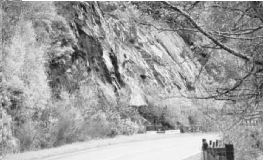
Identification of minerals like this metamorphic rock is based on analysis of light patterns they form when thin sections of the substance are tested with polarized light.

two. This will require additional effort on the part of teachers, but it should have positive results. With practice, students will become more analytic and require fewer explanations from the teacher.