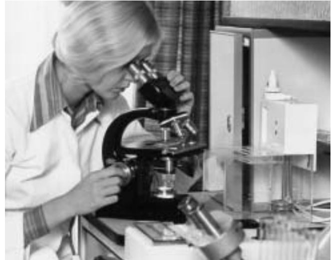
Scientific theories are based on the interpretation of observed data.

Third, the public needs to understand how science works. People sometimes get alarmed because scientific interpreta-