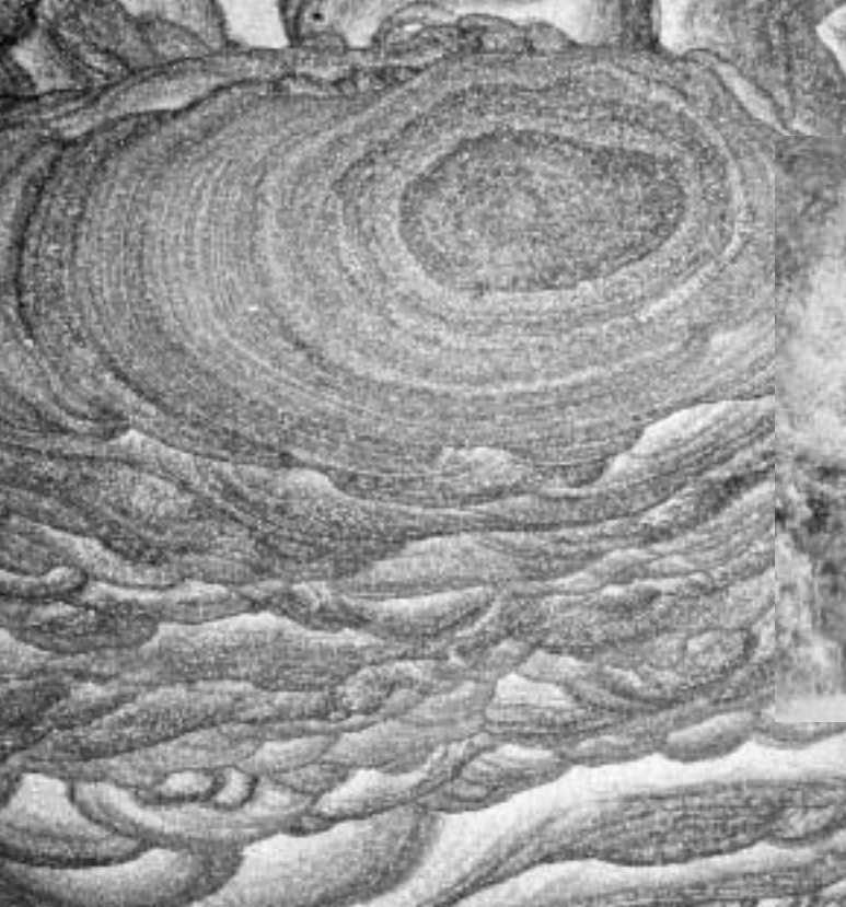
Cross-section of sandstone.