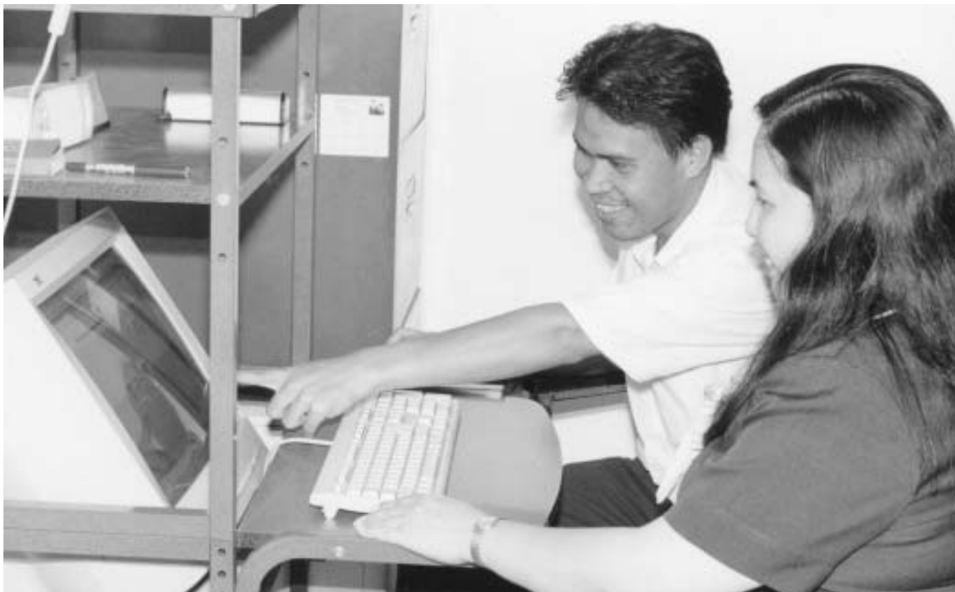
Southern Adventist University Web site committee members discuss the university's Web page design.

concluded that we really needed a database-driven site. Rather than hard-coding information directly into a static HTML page, we would construct a database containing the information. Whenever a resource needed to be added or a page edited, the templates from the database would automatically update the Web pages. So, instead of waiting for programmers to revise the Web site, librarians could do the work themselves. The committee began meeting again to redesign the library Web site. We simplified the page, changed the look, and with the help of two students, created a database-driven site.