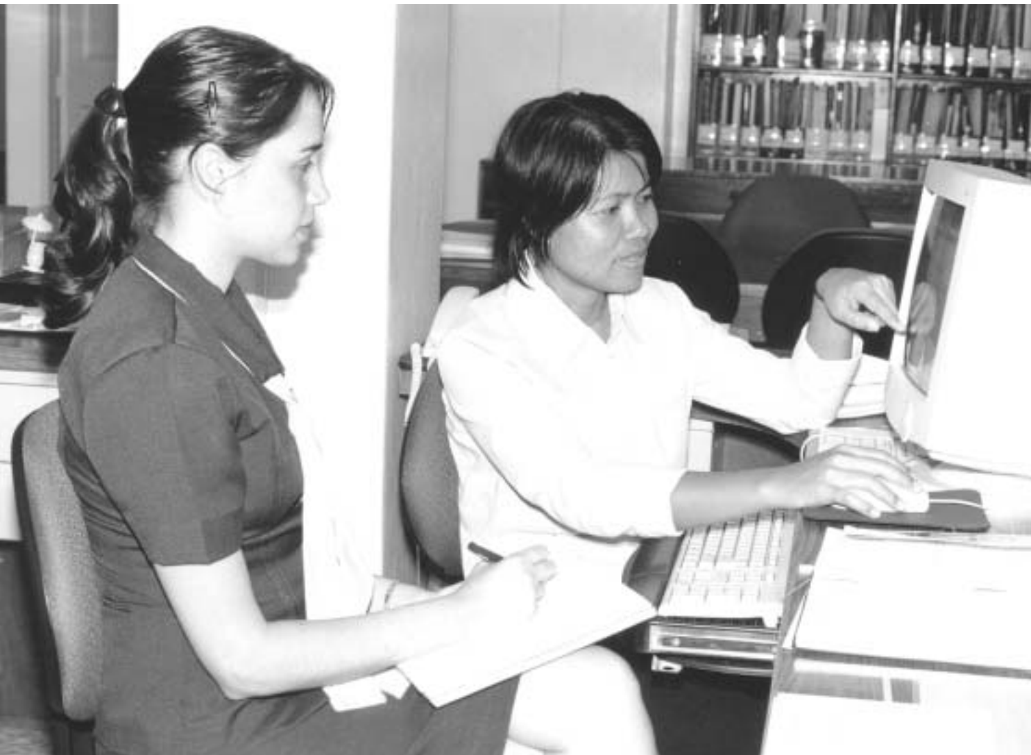
Observing a student as he or she uses the school Web site makes it possible to quickly detect navigation problems.

As we began to design the main page, each committee member made lists of content subjects they felt were important to post on the Web site. These elements included the official