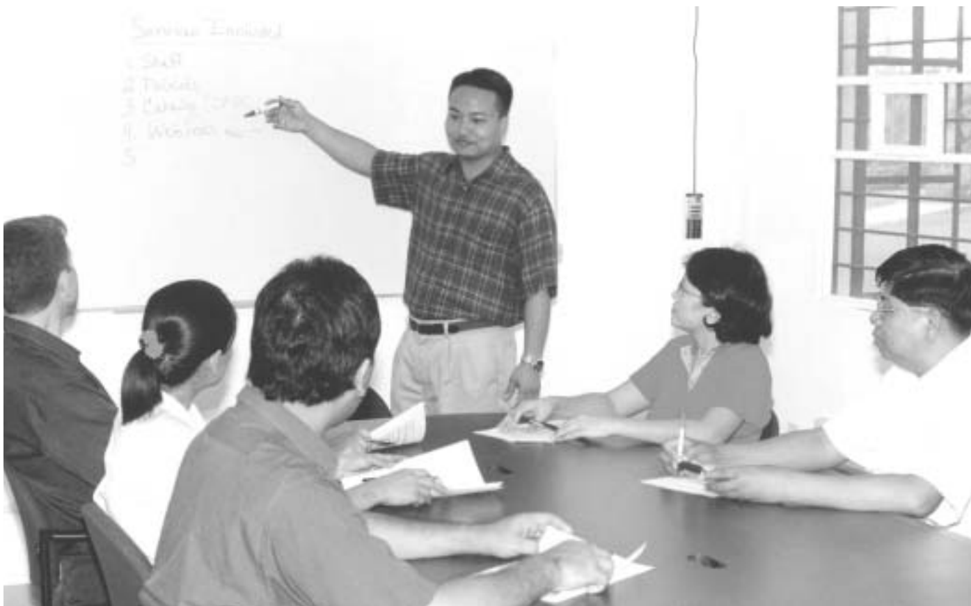
By involving a diverse group of advisors, the school Web site committee can more readily solve or prevent problems.