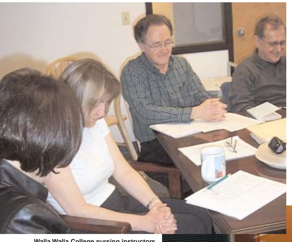
Walla Walla College nursing instructors pray for their students.

Don't all schools treat their students "nicely"? We in the Adventist educational system may take this for granted. Of course, a few students may not agree, especially when they must be held to high standards. This is not unlike the actions of loving parents making rules that are in the best interest of their children. However, Adventist nursing schools are well-known for respecting the life challenges and