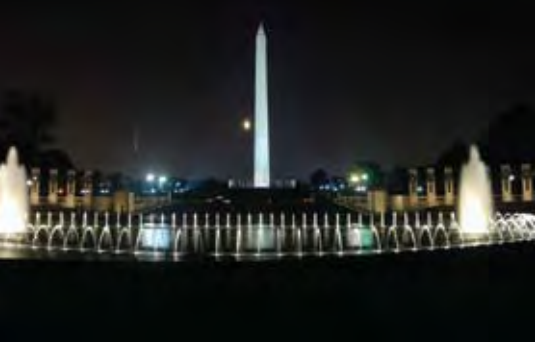
World War II Memorial, Washington, D. C.

What should we do about this loss of an important part of our Christian identity? The answer, as I see it, can be summed up in two words—educate and agitate. Collectively, we need to once again place noncombatancy, volunteering for service, and other military issues on the Adventist docket of issues worth living and dying for. Our church's history provides major hints at how to accomplish this neglected task. ✍