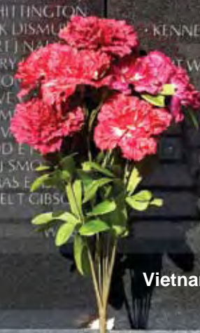
Vietnam Veterans Memorial, Washington, D. C.