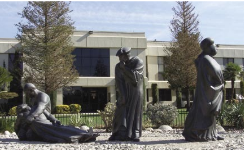
Good Samaritan statues at Loma Linda University (Loma Linda, California).

The Advanced Bible School, of course, didn’t solve the educational needs of most faculty. As a result, boards sought mature, experienced, “safe” faculty who could be sent to non-Adventist institutions for advanced study, hoping that the