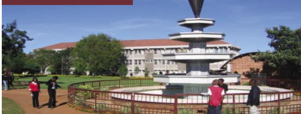
Fountain (which doubles as a baptismal font) at University of Eastern Africa, Baraton (Eldoret, Kenya).