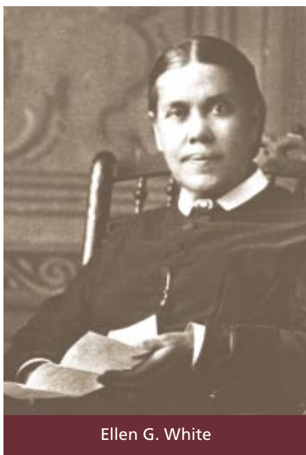
Ellen G. White

It is of the utmost importance to recog-