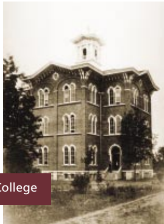
Battle Creek College

OF ADVENTIST HIGHER EDUCATION AND THE ONGOING TENSION BETWEEN