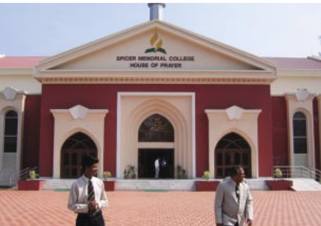
House of Prayer, Spicer Memorial College (Pune, India).