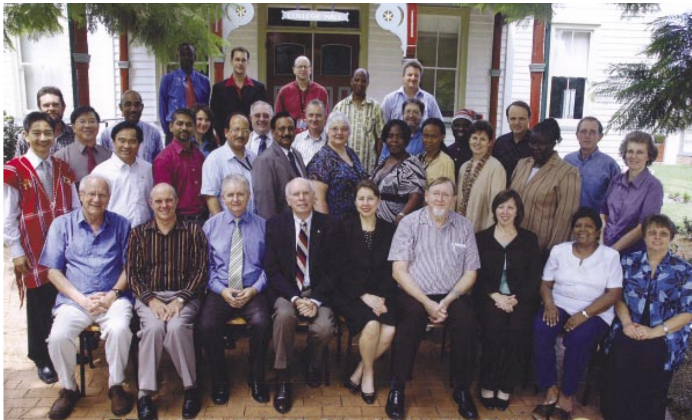
Educators from 16 countries attended the 37th International Faith and Learning Seminar (Institute for Christian Teaching) in February 2008 at Avondale College (Cooranbong, Australia).