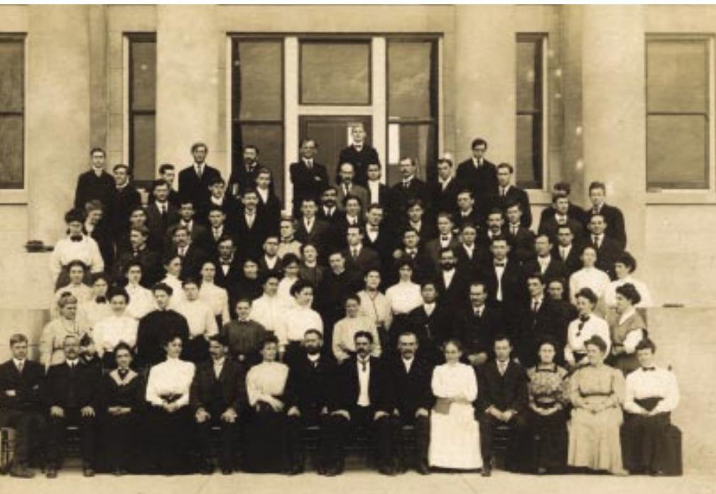
Teachers and students of the Washington Foreign Mission Seminary (Takoma Park, Maryland), sometime between 1905 and 1913.