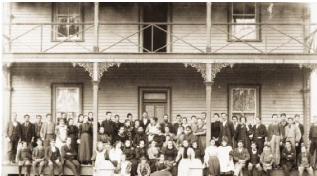
Early photo of teachers and students at Avondale College (Cooranbong, Australia), which opened in 1897.

lowing the lead of the recently organized Student Volunteer Movement for Foreign Missions, American Protestants were spearheading in the 1890s a move for "the evangelization of the world in this generation," which brought about the greatest expansion of missions in American history. 23 The foremost educational outcome of that mission thrust was the