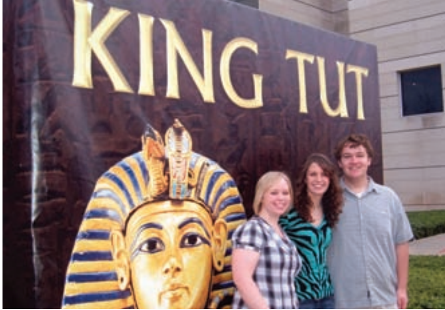
Honors programs include many cultural enrichment activities. Students from Southwestern Adventist University and Union College joined together in February 2009 to visit an exhibit of artifacts related to King Tutankhamun in Dallas, Texas.

odologies with students of other disciplines, often in circumstances conducive to memorable conversations (in my case, most recently in a filled-to-capacity minivan on a nine-hour return trip from an Honors conference). These discussions, sometimes structured, sometimes not, often form the richest experiences students take away from their programs.