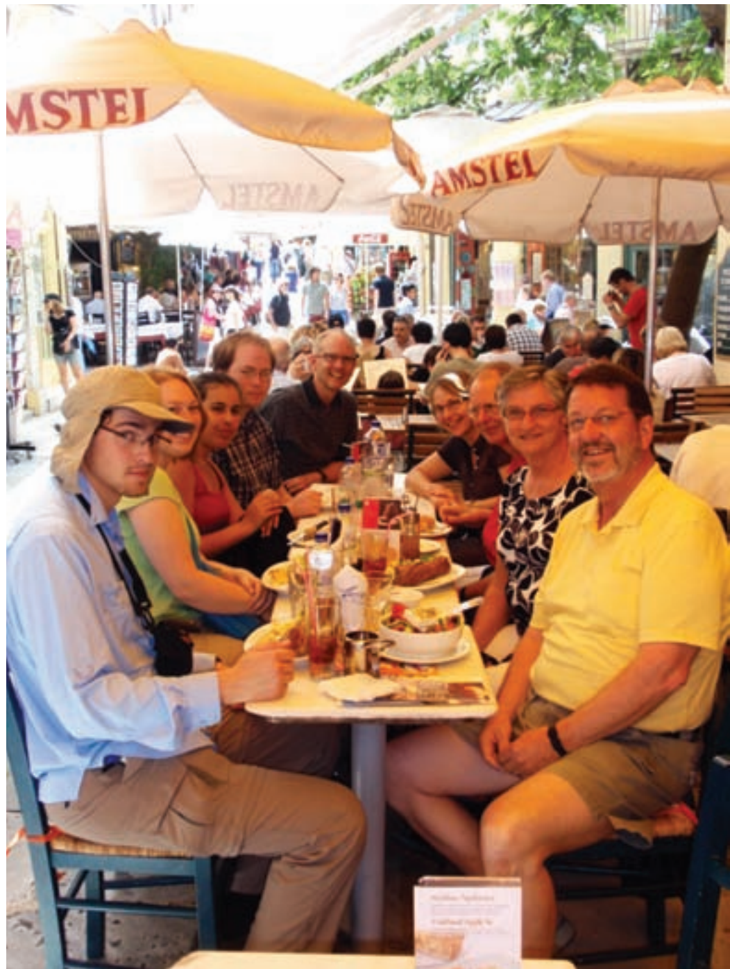
Southwestern Adventist University Honors students and faculty gather for lunch in Athens for discussion about their visit to the Acropolis and new Acropolis Museum.

fruitful pairings: technology courses that combine manual skills with history of technique; visual arts and mathematics; and ethics and business. Designing cross-disciplinary courses can be demanding, however; persuading deans and chairs to allow their departmental faculty to devote time to the Honors program may be difficult.