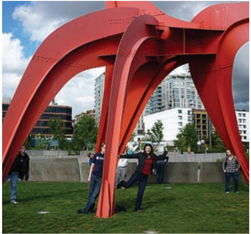
Above: Walla Walla University Honors students meet Alexander Calder's Eagle at the Olympic Sculpture Park in Seattle, Washington.

A fundamental challenge of any Honors program is the relationship between the Honors community and the campus. Often instructors and administrators see young people enrolled in Honors programs as exemplary students who will have the most beneficial impact on campus if they experience maximum interaction and integration with non-Honors students. But it is difficult to achieve the potential synergy of exceptional students by dispersing them over the entire campus. Honors communities cannot be relied upon to spontaneously self-generate; creating them takes effort. An Honors learning community cannot exist without shared experiences and shared spaces. A comprehensive Honors general-education curriculum facilitates the creation of cohorts, supported by co-curricular activities both on and off campus. Some Honors programs establish separate dormitories for their students to promote this type of integration and synergy.