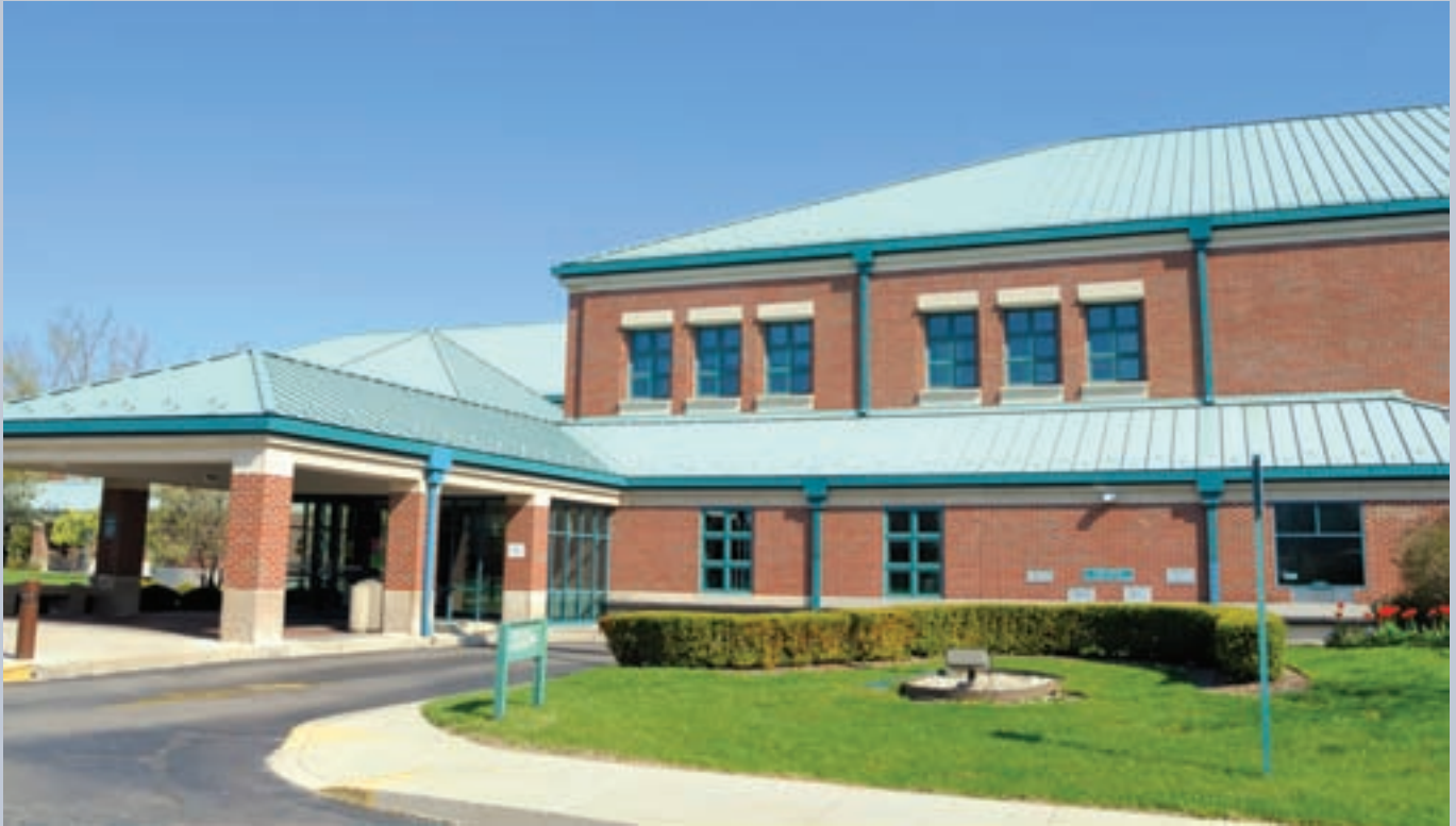
Many public libraries have trained staff that are more than willing to work with local school children.

Adventist schools are within reach of a university-sponsored support program, and few small schools are able to acquire, much less staff, substantial libraries on their own. But this is not a reason to abandon the idea of exposing students to libraries—the stakes are much too high for that. Rather, schools can find creative solutions that utilize the resources they are able to access.