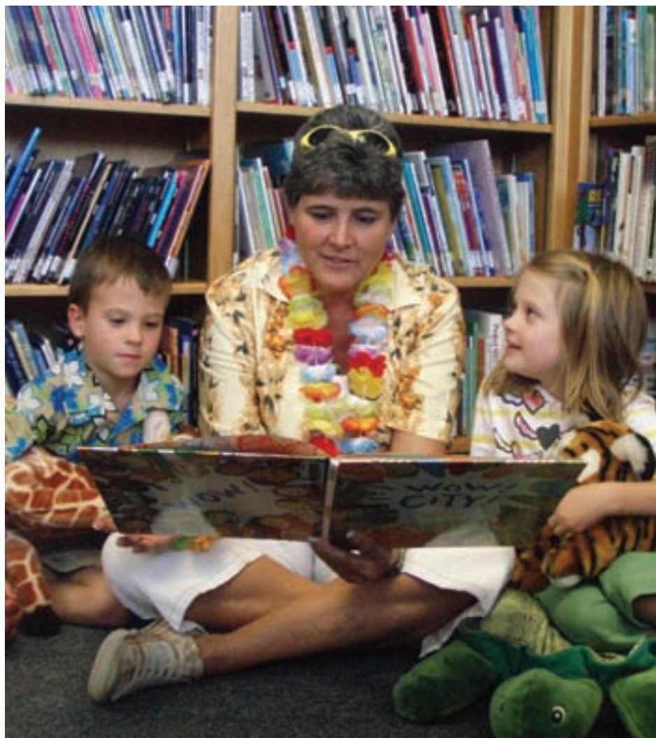
During story time, volunteers model fluent, expressive reading and help establish a foundation for a lifelong love of learning in young children.

The “right format” aspect of literacy is receiving greater attention. Even in the very early years of schooling, students are being introduced to information technology. They quickly learn which buttons to push to make a computer work, but