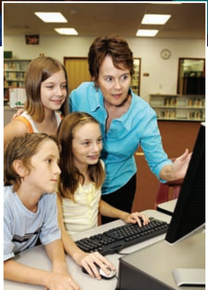
The library plays an important role as information provider, knowledge hub, and source of guidance for budding young researchers.